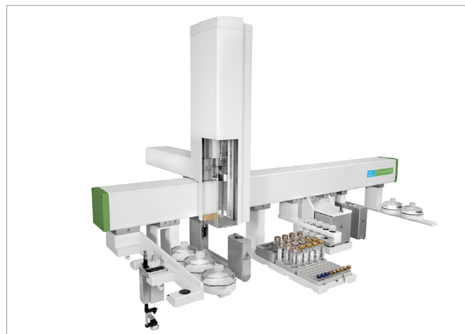
Figure 1. With the TurboMatrix MultiPrep Autosampler long rail option, you can run more samples or add more sample handling modules.

For example, the TurboMatrix MultiPrep options include vortexing to achieve reliable liquid homogenization; barcode validation of vials for advanced sample tracking; cooling, heating and agitation; and fast washing. The TurboMatrix MultiPrep+ provides all of these valuable automatic capabilities and provides several more, including internal standards addition, sample dilution, method-controlled changing of syringes, serial and calibration dilution, reconstitution, and in-vial extraction.