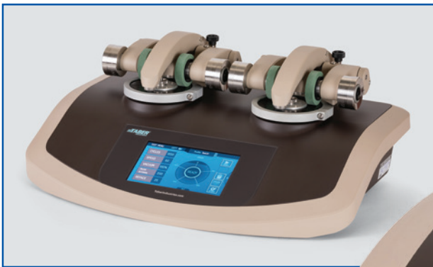
MODEL 1750 DUAL PLATFORM ABRASER