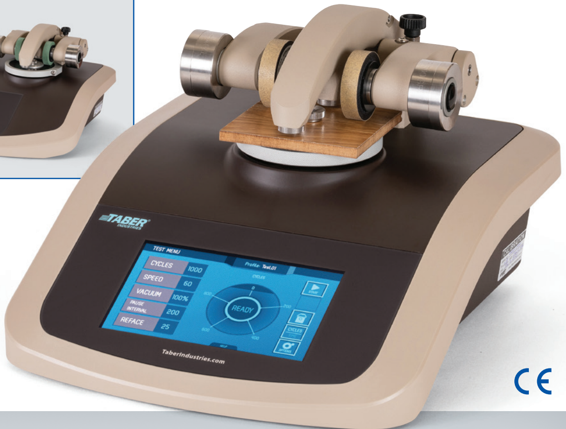
MODEL 1700 SINGLE PLATFORM ABRASER