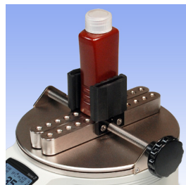
CT001 Flat jaws

Set of rubber jaws for gripping square or odd shaped containers.