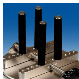
CT005 / CT006 / CT007 Extended length post sets

Complete set of brackets, cable, and hardware for calibration of any Series TT01 torque tester. Weights not available from Mark-10.