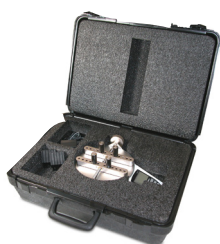
CT002 Carrying case

Set of rubber jaws for gripping square or odd shaped containers.