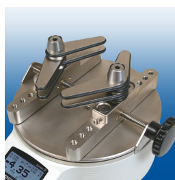
CT003 Adjustable jaws

Provides storage space for the TT01 tester, gripping jaws, AC adapter, and accessories.