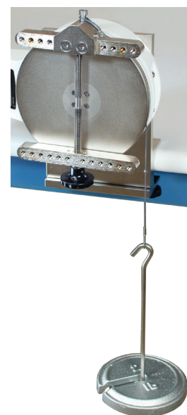
AC1036 Calibration kit

Rubber-edged arms may be independently repositioned to accommodate unique samples.