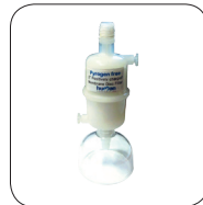
PF final filter (Pyrogen free)