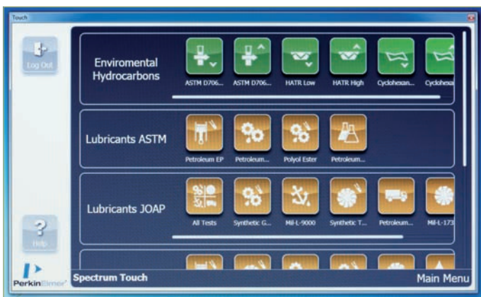
Touch App software provides intuitive operation.

An optional ATR based method allows operators to use any volatile solvent and obtain the full spectrum of the sample, while supplied macros can be updated or edited by the user to suit the requirements of their site. Plus, unlike dedicated analysers, Spectrum Two also has the performance capability and sampling flexibility of a FT-IR and can be expanded to perform many other test methods.